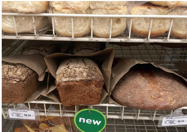
Baker Potter Rustic Breads, Saturdays at the Eastside Store

The Eastside store is now carrying breads from a new local bakery called Baker Potter! They use grains sourced from WA state and wild yeast. The bread is baked in wood-fired ovens. The two varieties we carry currently are the Dark Northern Rye bread and the Methow Red. These rustic loaves retail for $8.29 and are delivered only on Saturdays! ■